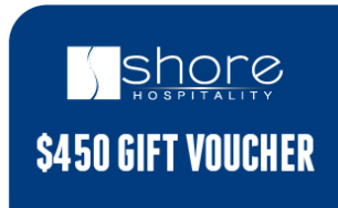
價值港幣$450回贈，可在 Shore Hospitality集團旗下任何品牌使用